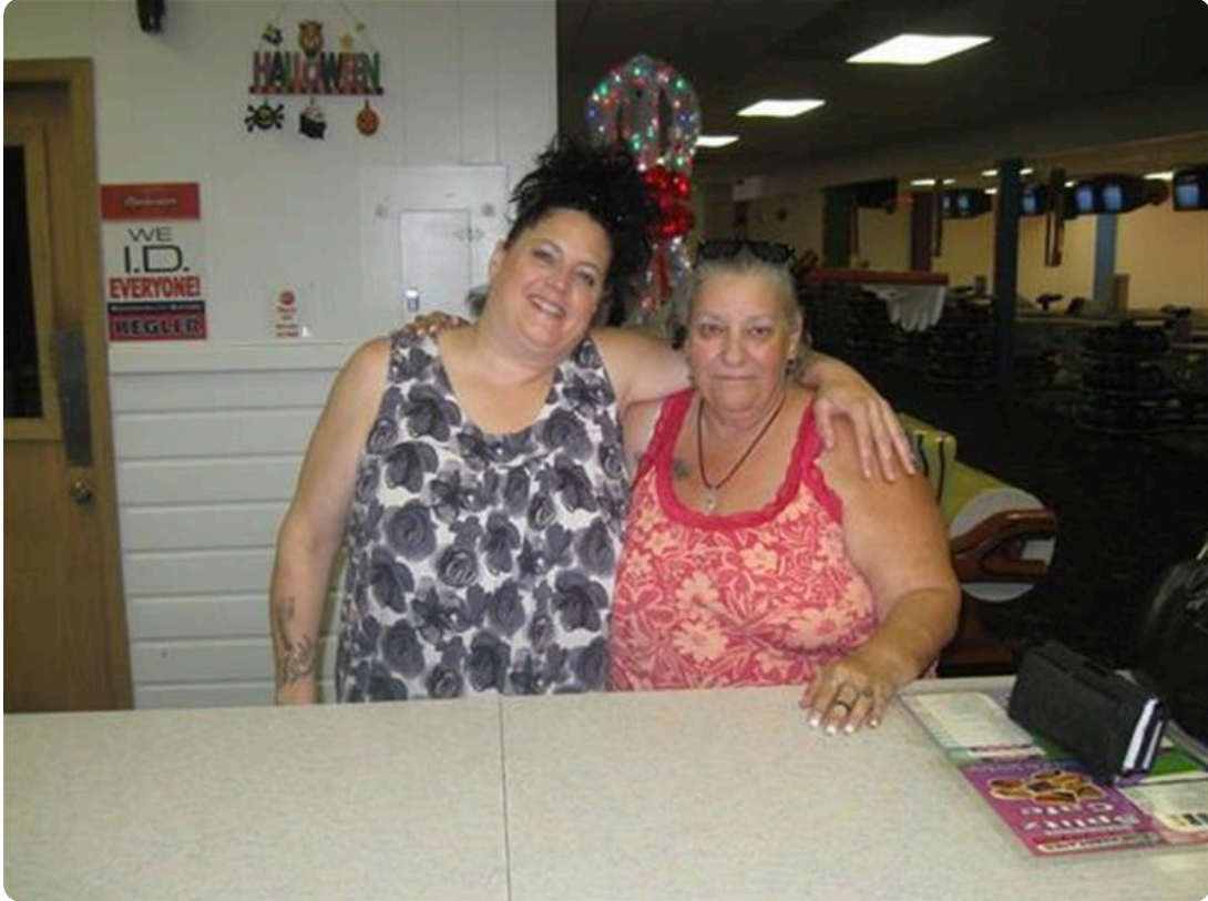
Me and Betsy- 2015